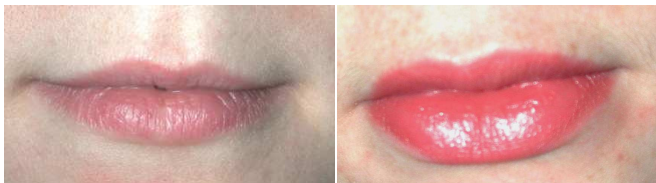
15 days before the test D15 - 10min. after application

Improvement in the condition of the lips' mucous membrane as observed by participants (X01AR012)