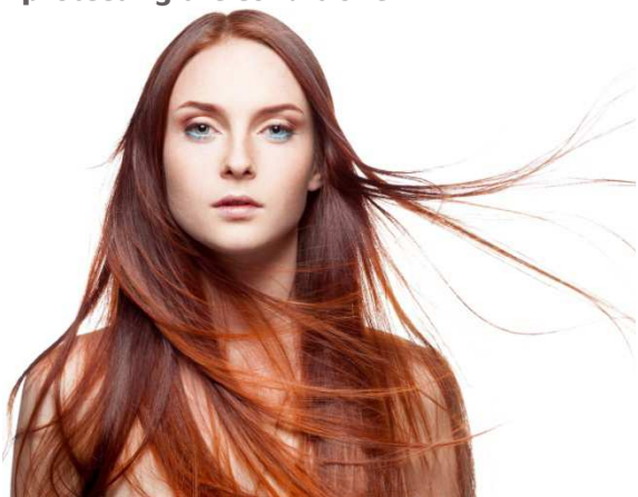
US20027A - 1402